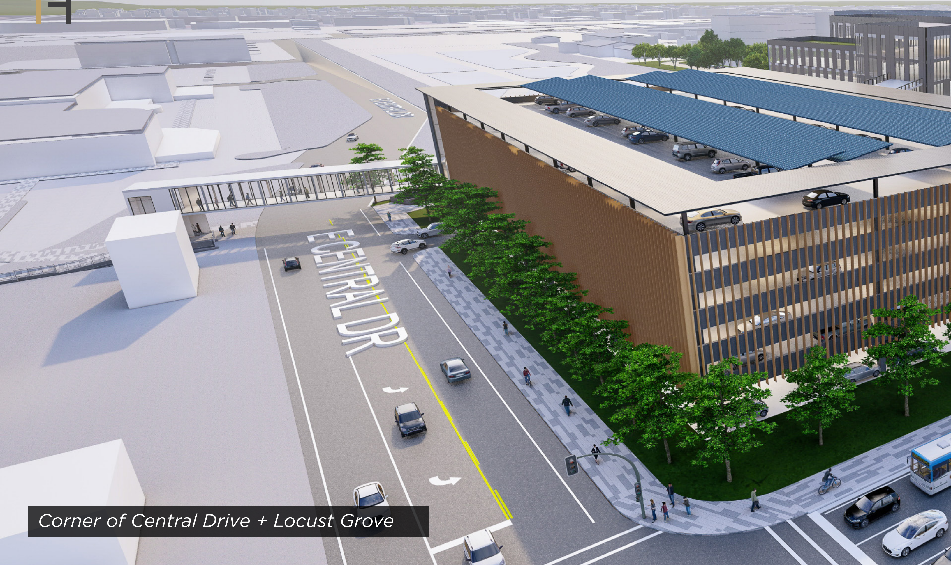
Corner of Central Drive + Locust Grove