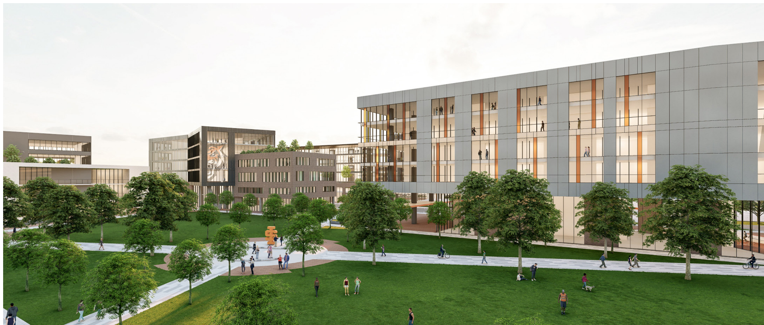
Looking South Towards Medical Education