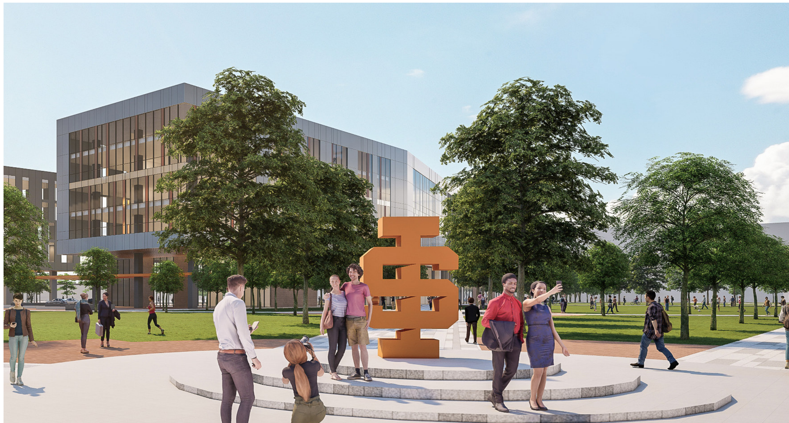
Internal Campus Looking Southwest at Multi-Use Facility