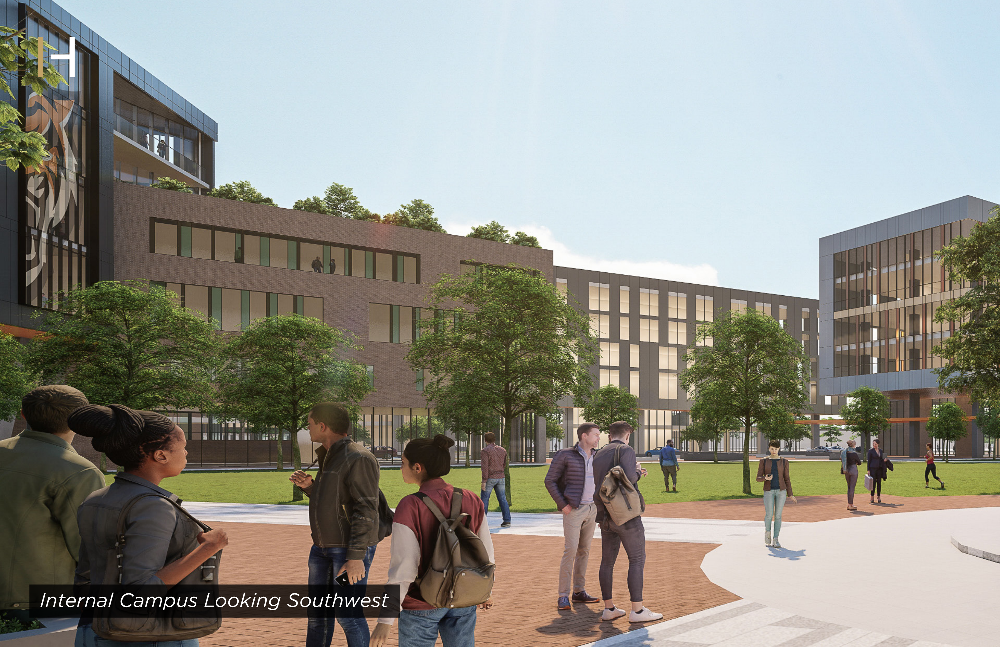
Internal Campus Looking Southwest