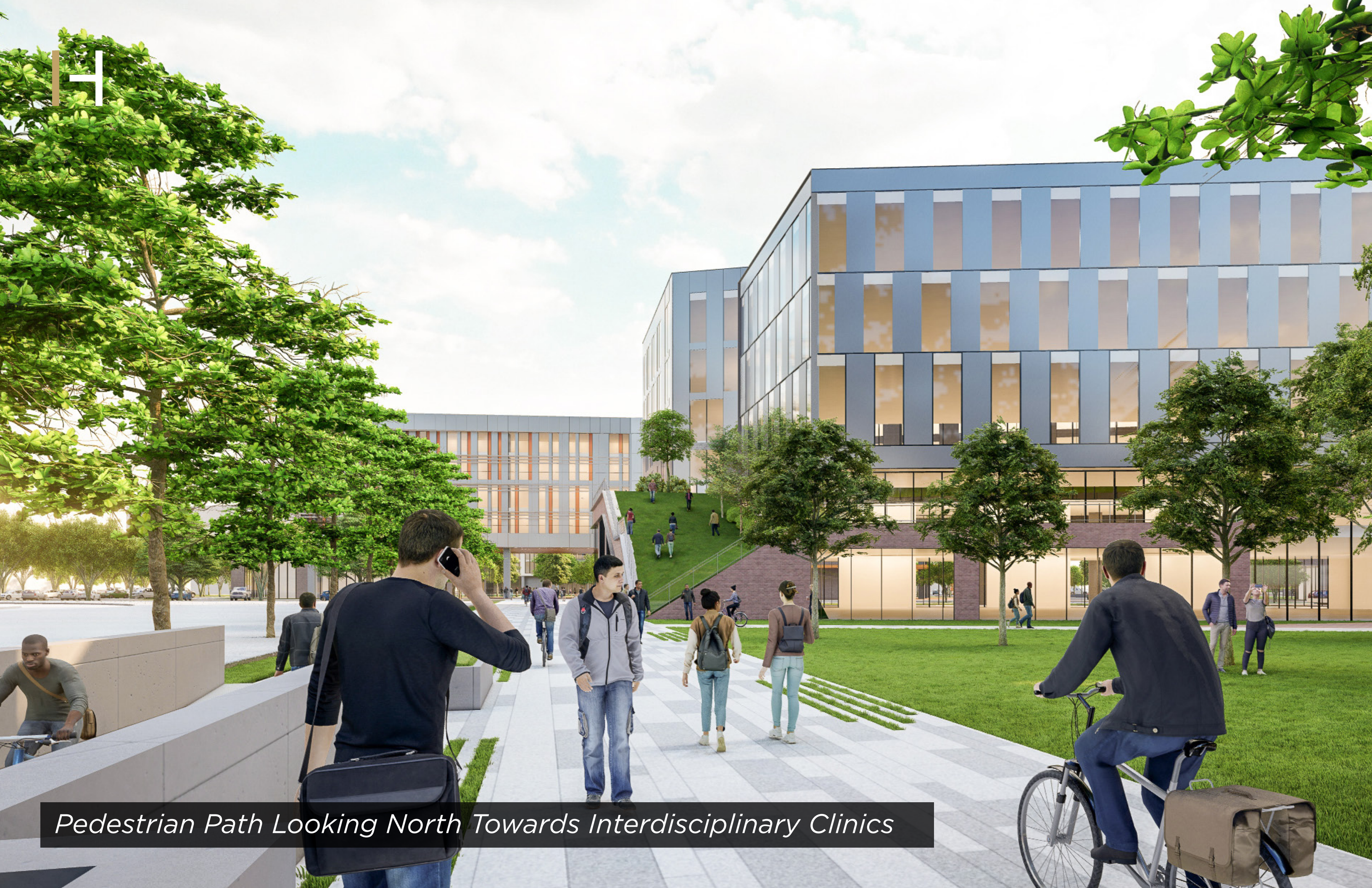
Pedestrian Path Looking North Towards Interdisciplinary Clinics