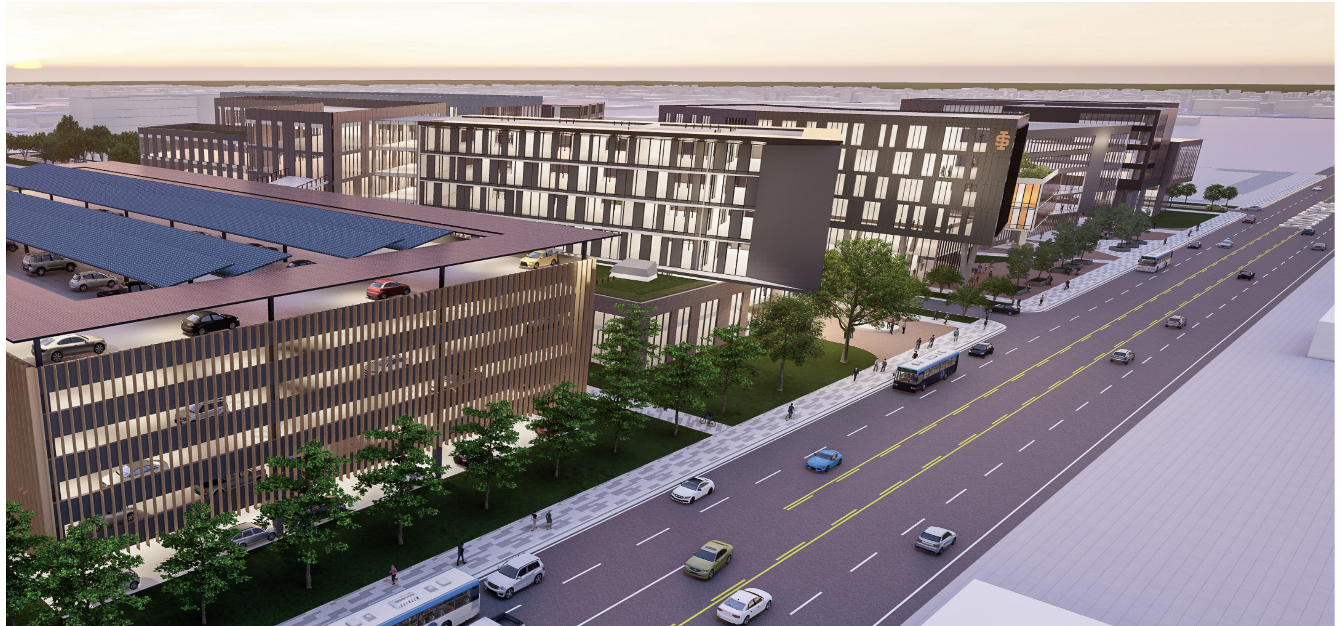
Locust Grove Looking West