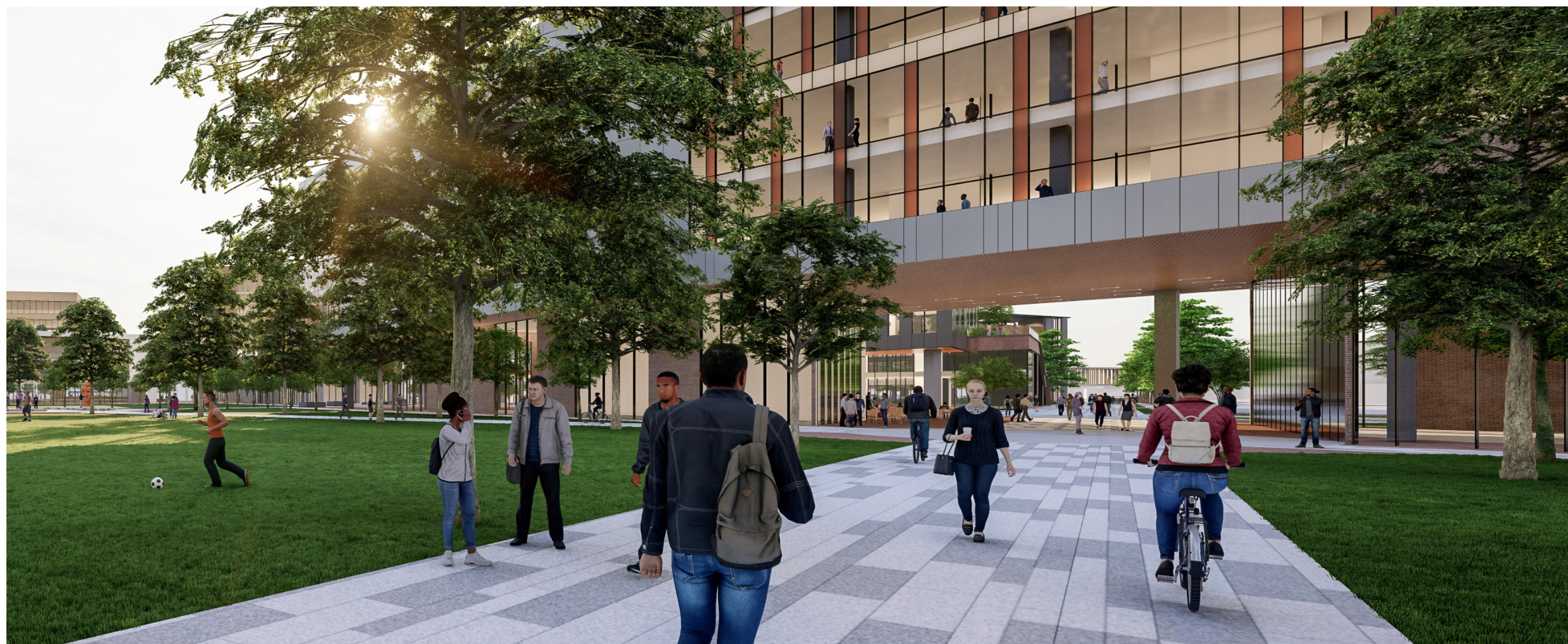
Internal Campus Looking South at Multi-Use Facility