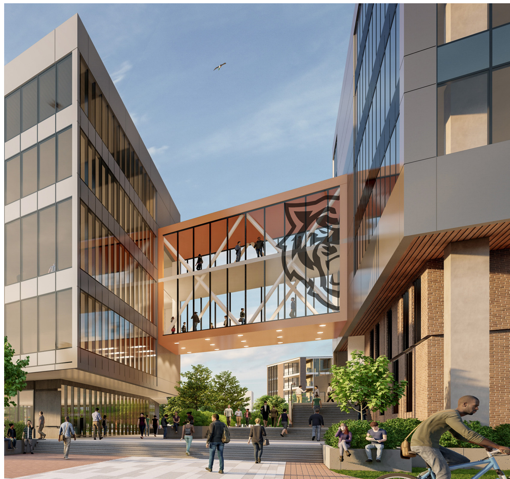
Locust Grove Looking West to Internal Campus