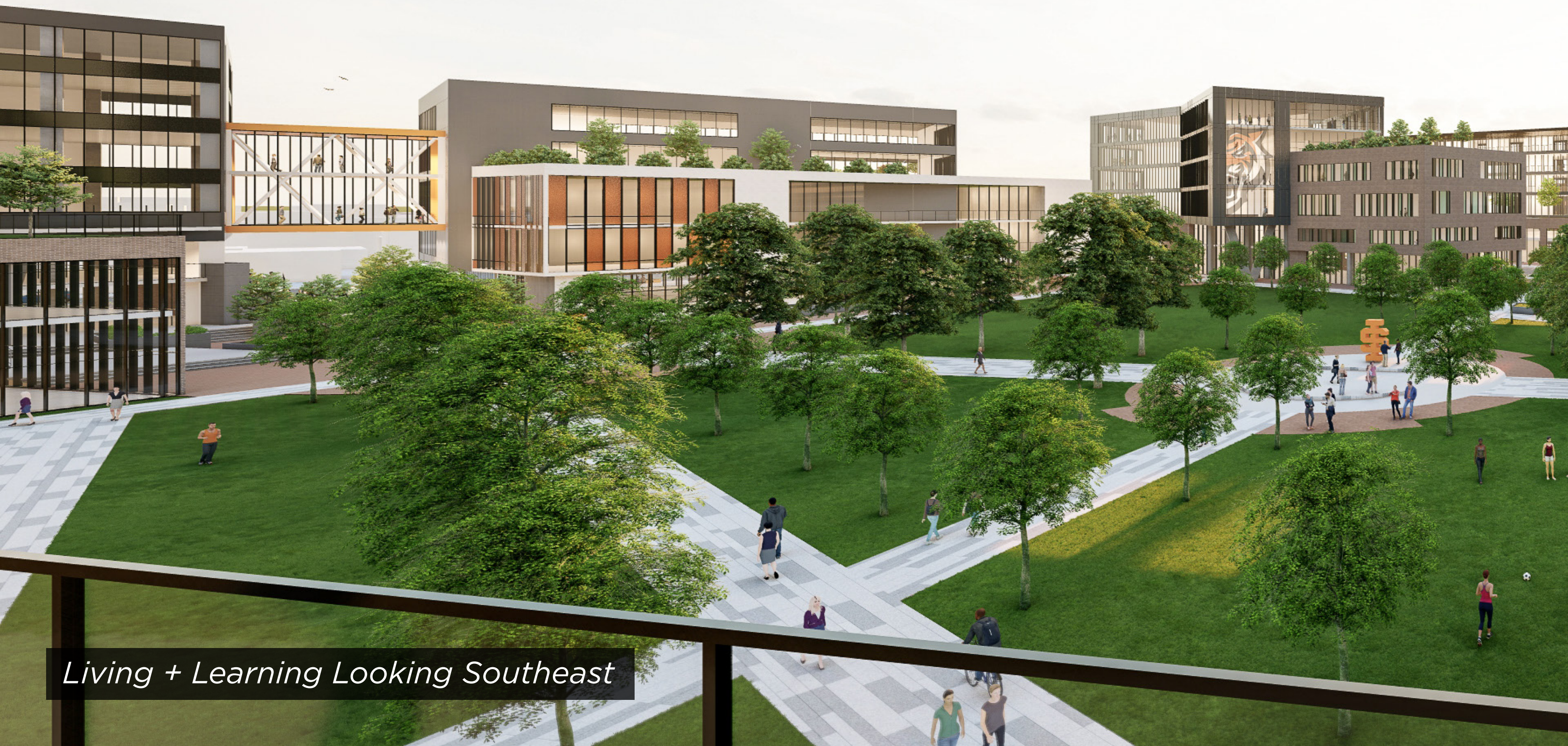
Living + Learning Looking Southeast